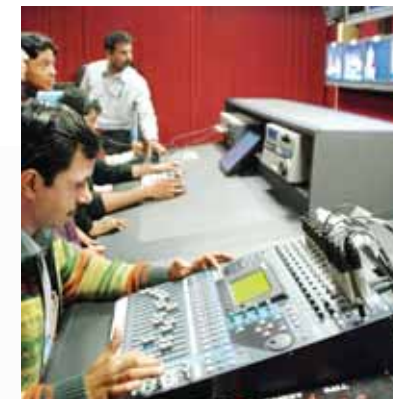
PCR connected with NLE suite of G5 Macs running FCP