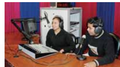
Clyde Synergy-based FM radio studio