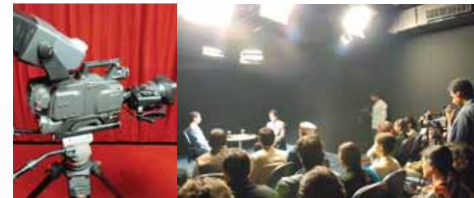
Sony Z1P based operations. Standard sets and chroma