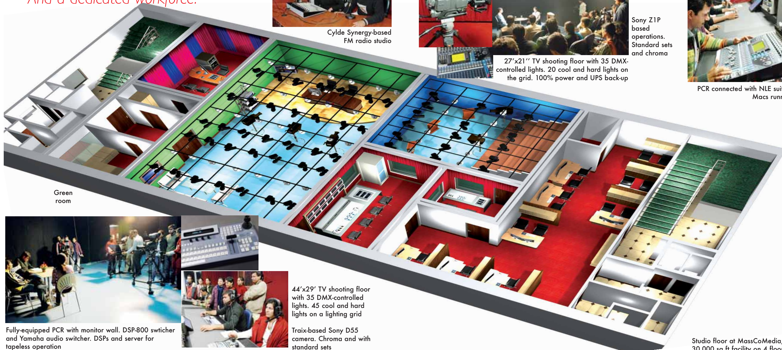
Studio floor at MassCoMedia, Noida. 30,000 sq ft facility on 4 floors.