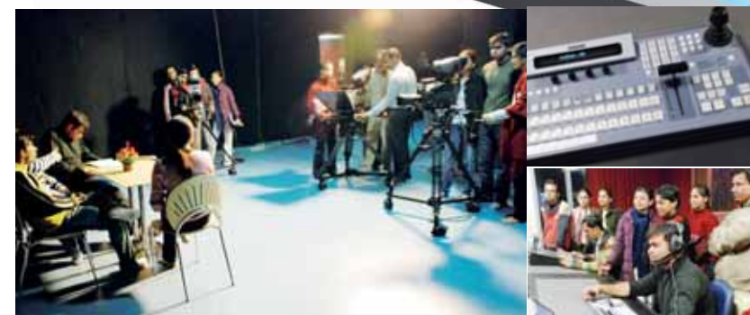
Fully-equipped PCR with monitor wall. DSP-800 switcher and Yamaha audio switcher. DSPs and server for tapeless operation